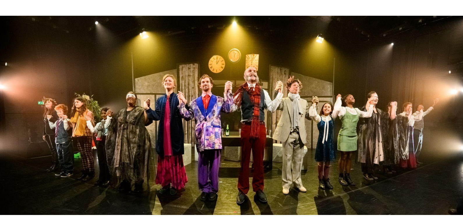
Annual Report 2023